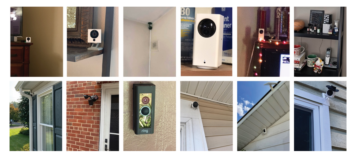
Figure 2: Examples of participants' indoor, outdoor, and doorbell smart cameras. The top row of images depicts various indoor camera placements, and the bottom row depicts outdoor camera placements. Notable images include a camera mounted upside down on the indoor ceiling, a camera placed among other domestic objects on a bookshelf, and an outdoor camera adorned with a small, decorative cowboy hat.